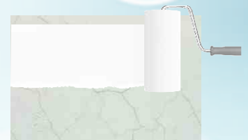
Excellent Crack Bridging