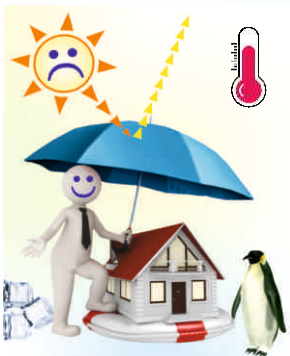
Excellent Heat Reflection Reduces Room Temperature