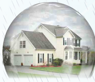
Protect from Rain Water leakages